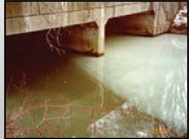
Discharge of rinse from floor sanding