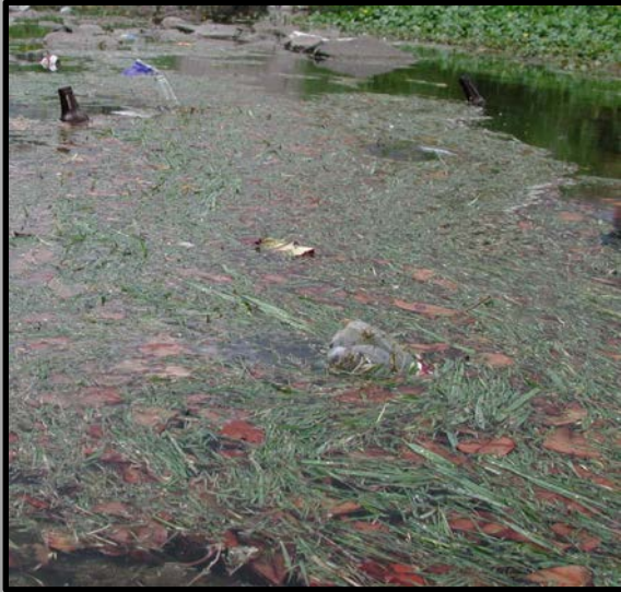
Leaves and grass clippings