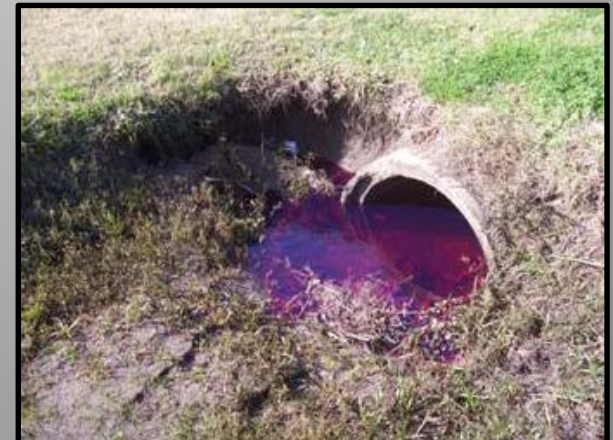
Dark red, purple, blue, black