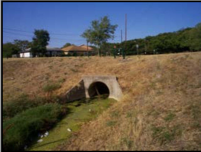
Pea-green/ bright green