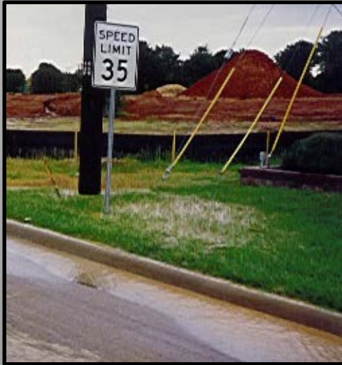
Dirty water in the street