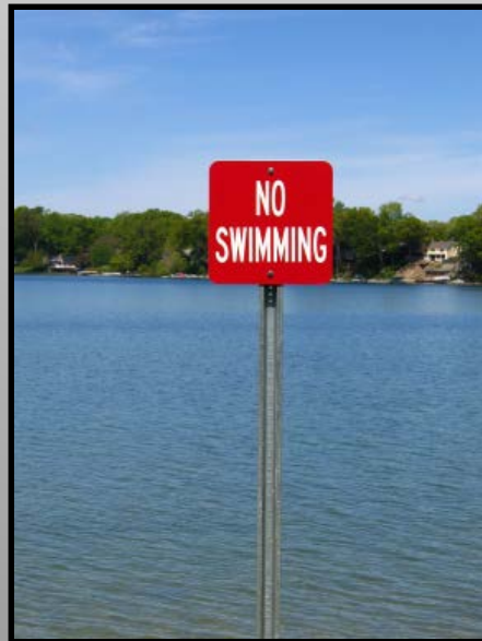
Wayne County, MI