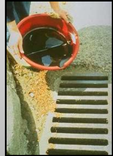
Liquids dumped down a storm drain