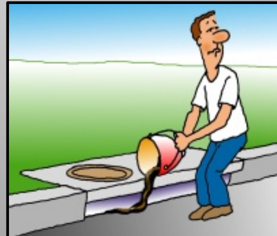
Montgomery County, MD