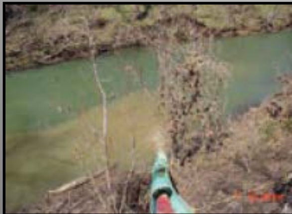
Tan to light brown