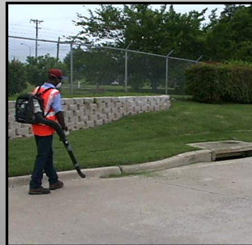
Solids blown or swept in the street or down a storm drain