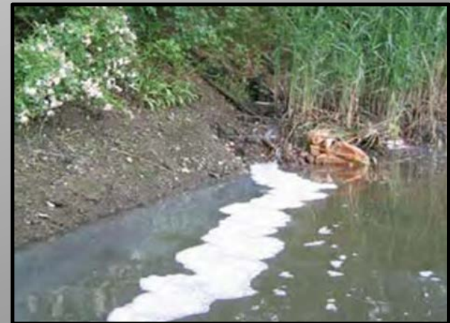
Center for Watershed Protection