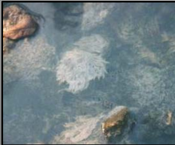
Wayne County, MI