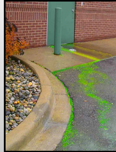
Unusually colored discharges