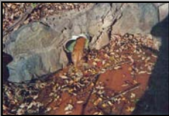
Unknown brown turbid discharge