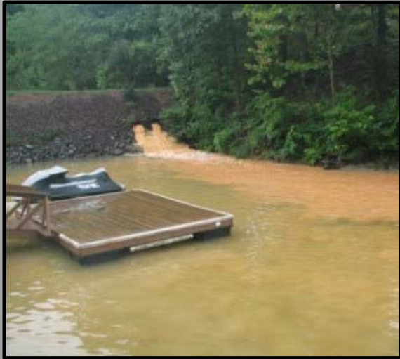
Construction site discharge