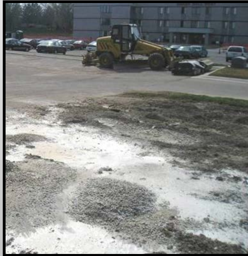
Wash out of solids/liquids