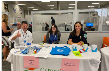
Photos of our very first Okaloosa County-Exclusive Career Fairs. March 30 in Fort Walton Beach and April 12 in Crestview.