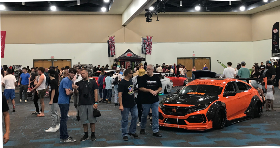
Slammedenstuff Car Show