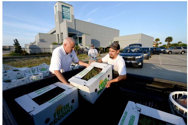
Staging for Sea Oat Planting Volunteers