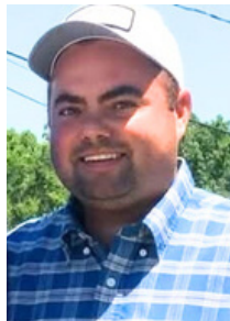
Road Division Public Works