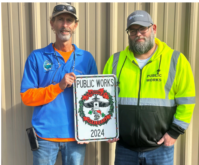
Pictured left: The winners of the 2024 Public Works Christmas gathering cornhole tournament champions