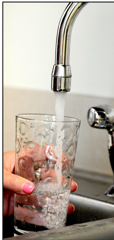
AFTER THE STORM