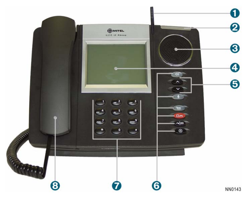
The Mitel 5235 IP Phone consists of