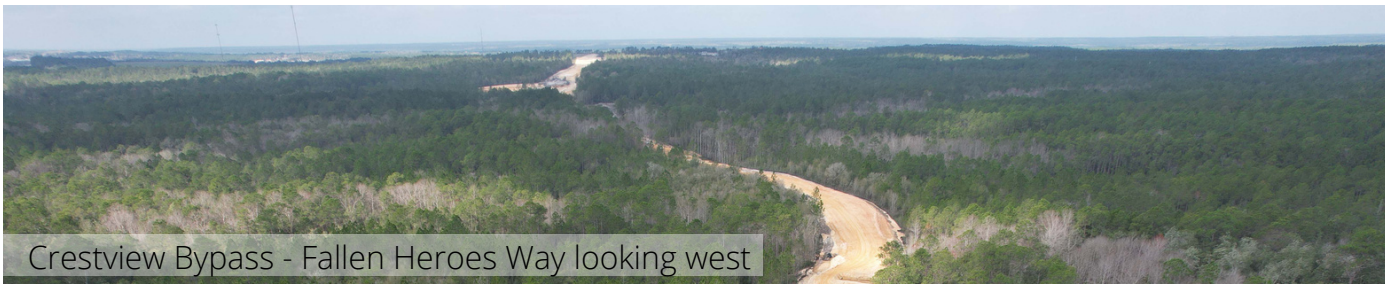
Crestview Bypass - Fallen Heroes Way looking west