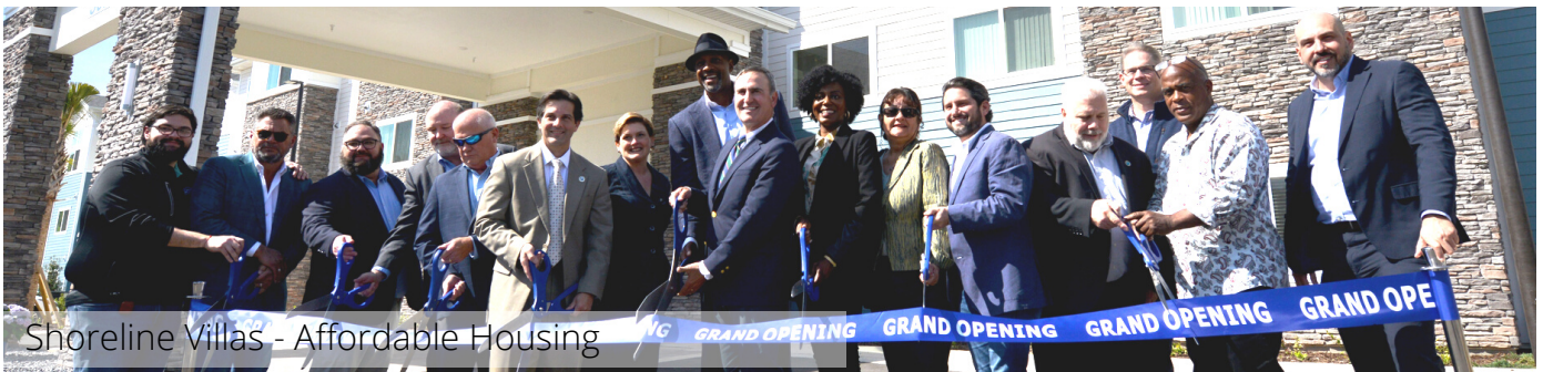
Shoreline Villas - Affordable Housing