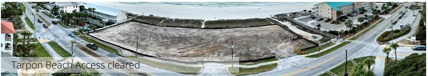
Tarpon Beach Access cleared

Stay Engaged. Click the logos to join us on social media