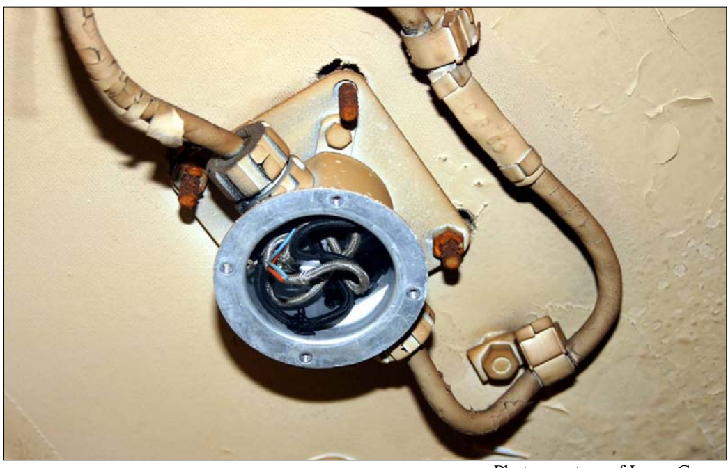
Mercury removed from smoke detector onboard the ex-USS Oriskany.

Ship system components using mercury (e.g., some gyroscopes, vacuum measurement gauges, some laboratory equipment, some light switches, some older radar displays) should be removed from the vessel. All portable thermometers and other measuring equipment employing mercury should be removed intact from the vessel. Any other extant mercury or items containing mercury should be removed from the vessel. Even minute quantities of mercury may be of concern and should be removed. Note that there is a health hazard associated with airborne mercury.