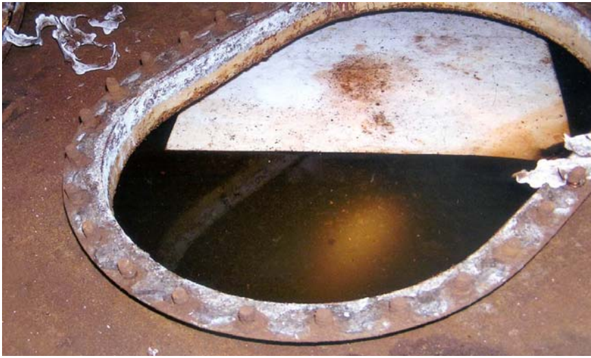
Oil absorbent pad in engine room bilge of the ex-USS Oriskany.

Cleaning bilges is frequently complicated by poor access caused by piping, gratings, and equipment. In many cases, it is cheaper and easier to remove the dirty or contaminated items that limit access than to clean the items as well as the bilge. Once clean, bilges are very vulnerable to recontamination. Note the following recontamination issues: