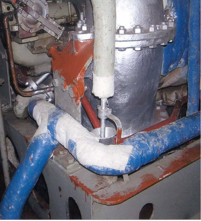
Patched asbestos pipe wrapping on the ex-USS Oriskany.

In some engine rooms asbestos/cellulose sheets are found behind power and electrical panels or in the overhead where electrical service passes. Undisturbed, this material is not friable. However, once the sheets are exposed to the marine environment, the sheets lose their integrity and can break up and raft. Where possible, these sheets should be removed. Note that asbestos cement sheets may also be used as panels on the vessel. However, these sheets are not water-soluble and therefore should not break apart when exposed to the