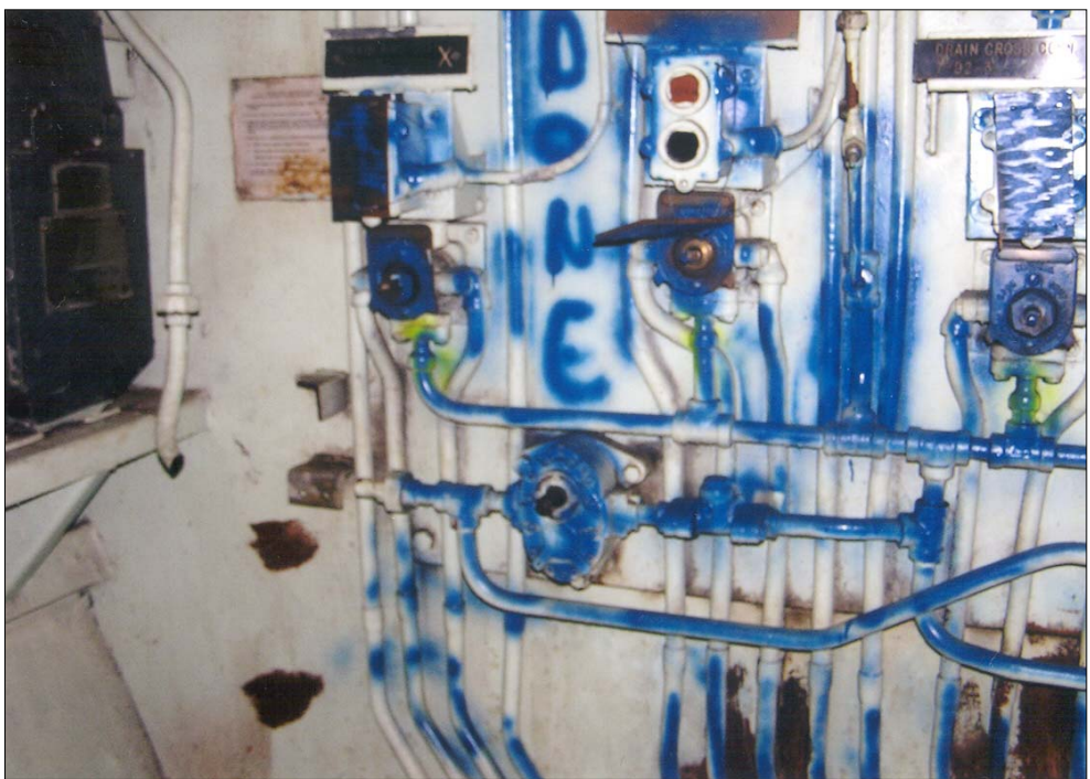
Flushed hydraulic system onboard the ex-USS Oriskany.