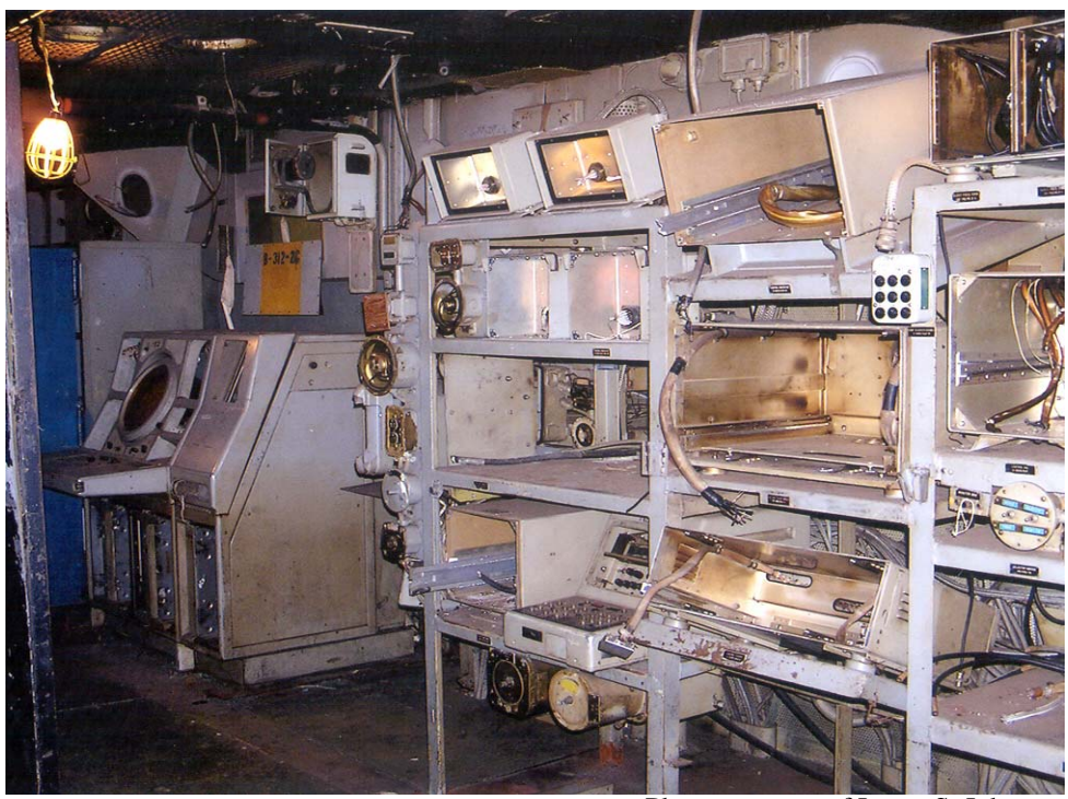
Ex-USS Oriskany electronic equipment stripped of capacitors and transformers.