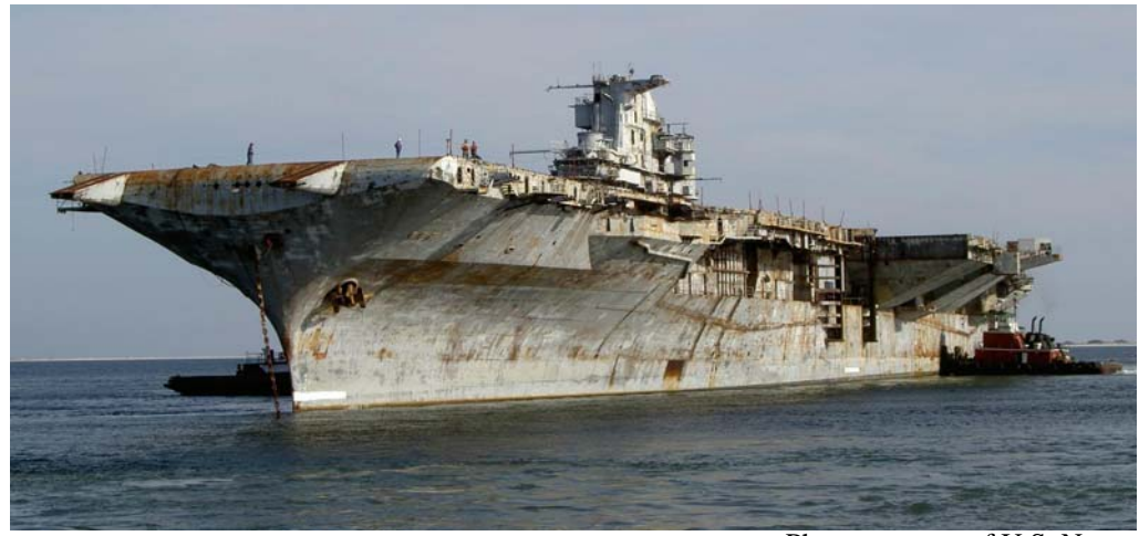
Ex-USS Oriskany arriving at NAS Pensacola, Florida. March 23, 2006.

If the narrative clean-up goals provided in this document cannot be economically achieved, for example because of very significant amounts of materials of concern on the vessel, then the vessel would not be a good candidate for reefing. The methods, approach, and level of effort for clean-up, as well as worker safety concerns, are directly dependent on the vessel's condition and the amount of materials of environmental concern that are found aboard. Vessels where clean-up could pose potential worker safety risks or could incur high costs may not be good candidate vessels for reefing.<sup>2</sup>