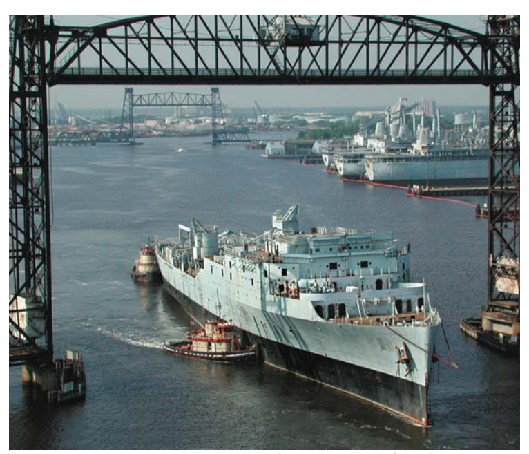
Ex-USS Spiegel Grove, once a MARAD vessel, under way to Florida Keys for final sinking preparations.