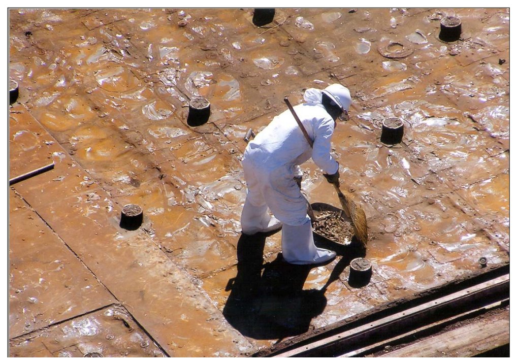
Worker sweeping debris during flight deck removal onboard the ex-USS Oriskany.