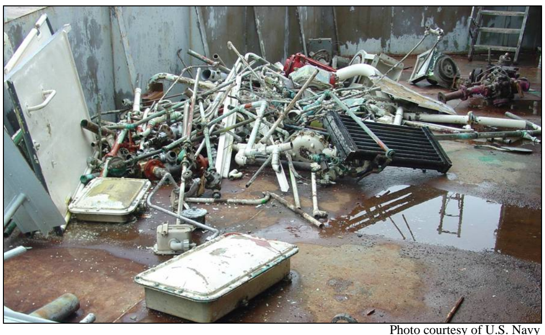
Metal recovery and salvage operations onboard the ex-USS Oriskany while being cleaned.