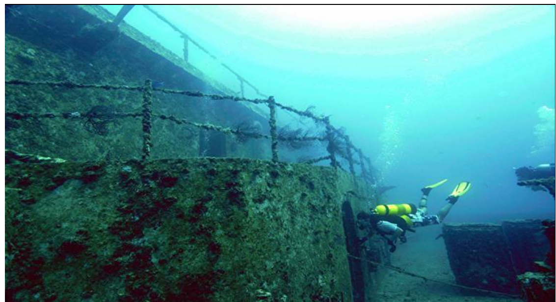
Diver exploring the ex-USS Spiegel Grove artificial reef.