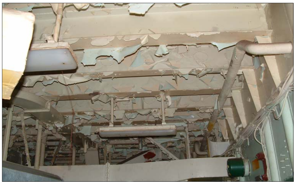
Exfoliating ceiling paint on the ex-USS Oriskany before being cleaned.

For most types of candidate vessels for reefing, the paint-related contaminants of concern are limited to exterior hull coatings below the water line. These hull coatings consist primarily of anti-fouling (AF) agents (biocides) such as copper, organotin compounds, and zinc.