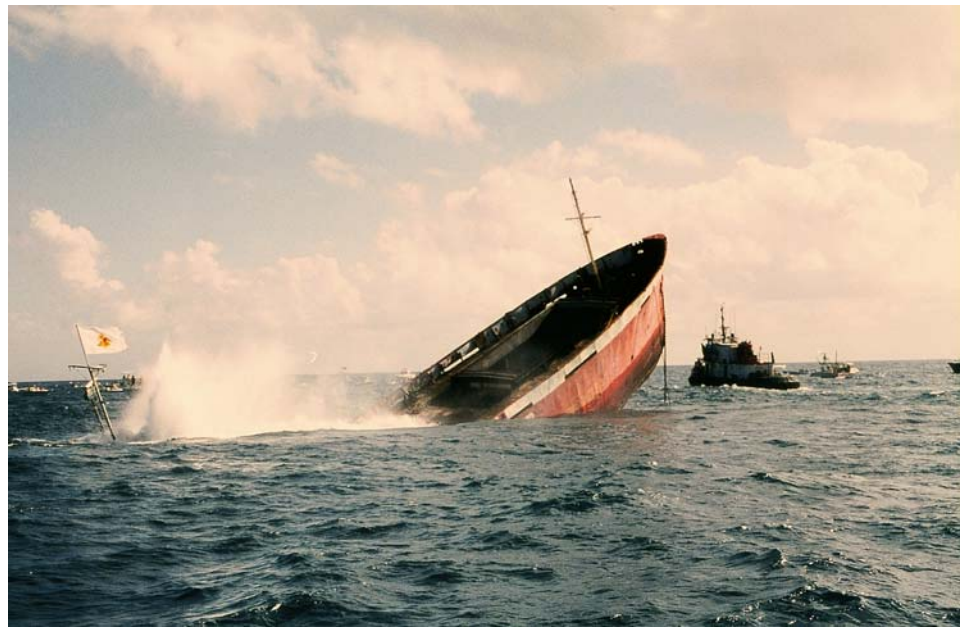
The scuttling of Adolphus Busch on Dec. 5, 1998, approximately 7 miles S of Summerland Key, Monroe County, Florida.